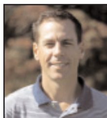
Doug Hamilton Golf