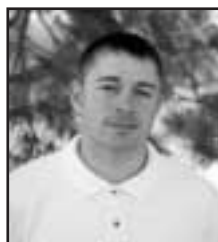
Phil Frost Golf