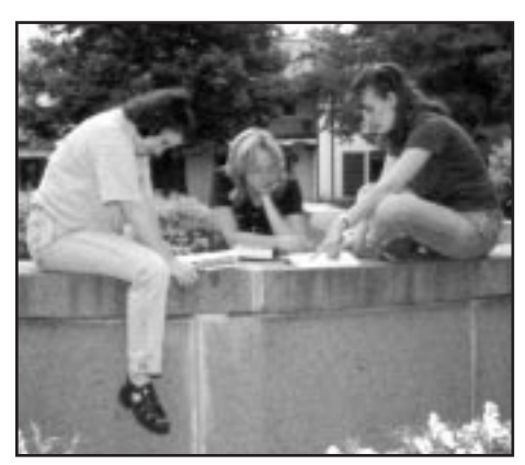
2000-01 Media Guide